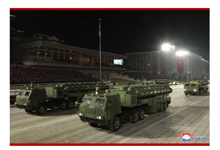
Possible land attack cruise missile

known to have tested "intermediate-range cruise missile ^{\rm 38} and would probably need to carry out a trial firing. ^{\rm 39}