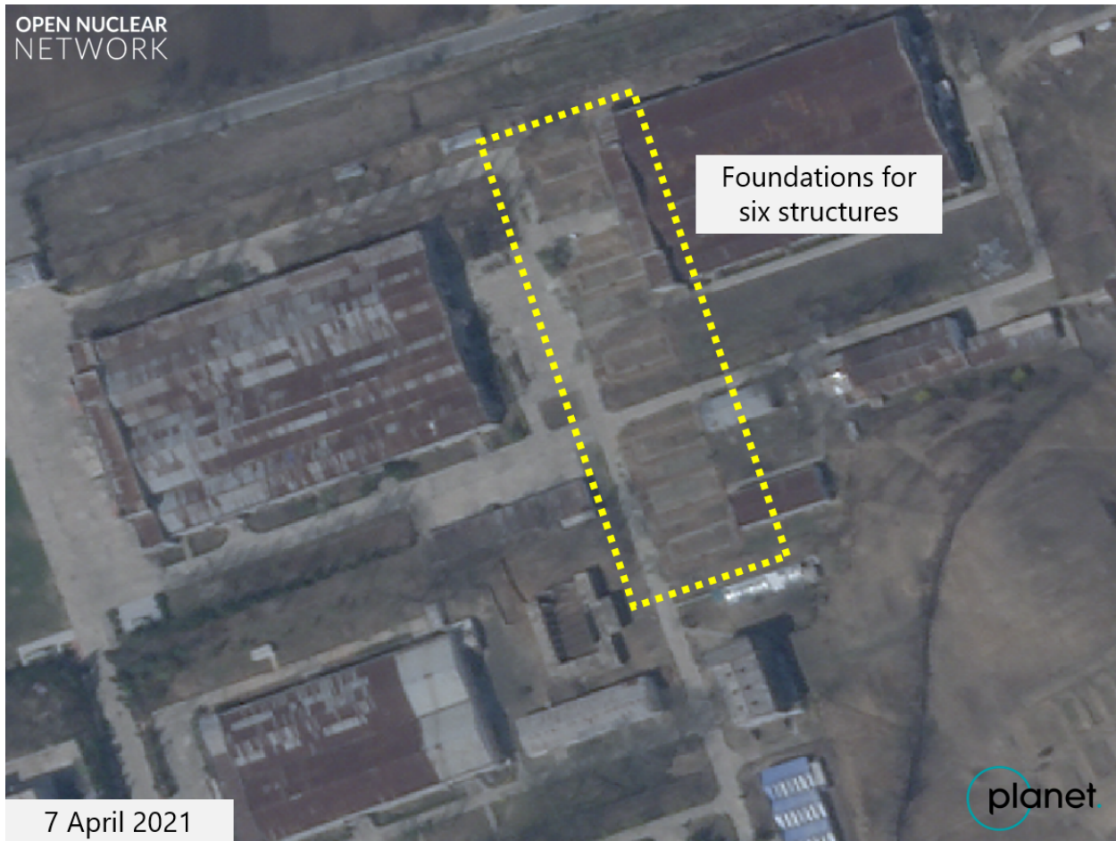
Figure 3. Foundations for six structures appeared in a satellite image dated 7 April 2021.

It is not clear whether the new structures are intended to serve production, logistical or support purposes. ONN will continue to monitor developments at this site.