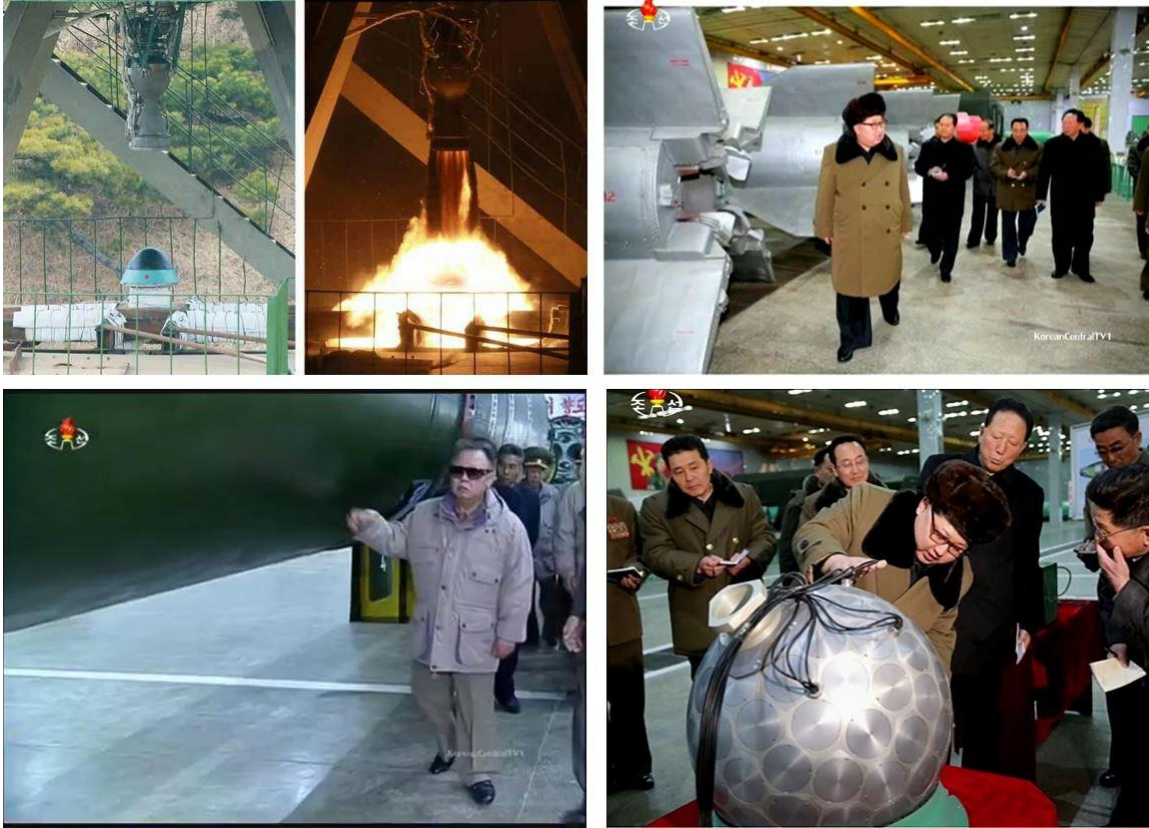
Figure 2. Top left: the engine test stand at the Chamjin Missile Factory was used to imitate the thermal environment in an ablative material test for re-entry vehicles on 14 March 2016. 3 Other photos: State television video frames showing Kim Jong Il and Kim Jong Un inspecting components of the DPRK's nuclear weapons programme in different times. It is believed that the videos were taken at the Chamjin Missile Factory. 4