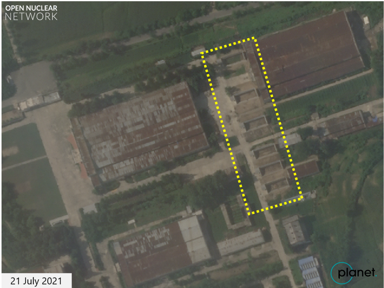
Figure 4. Progress made in the construction as of 21 July 2021