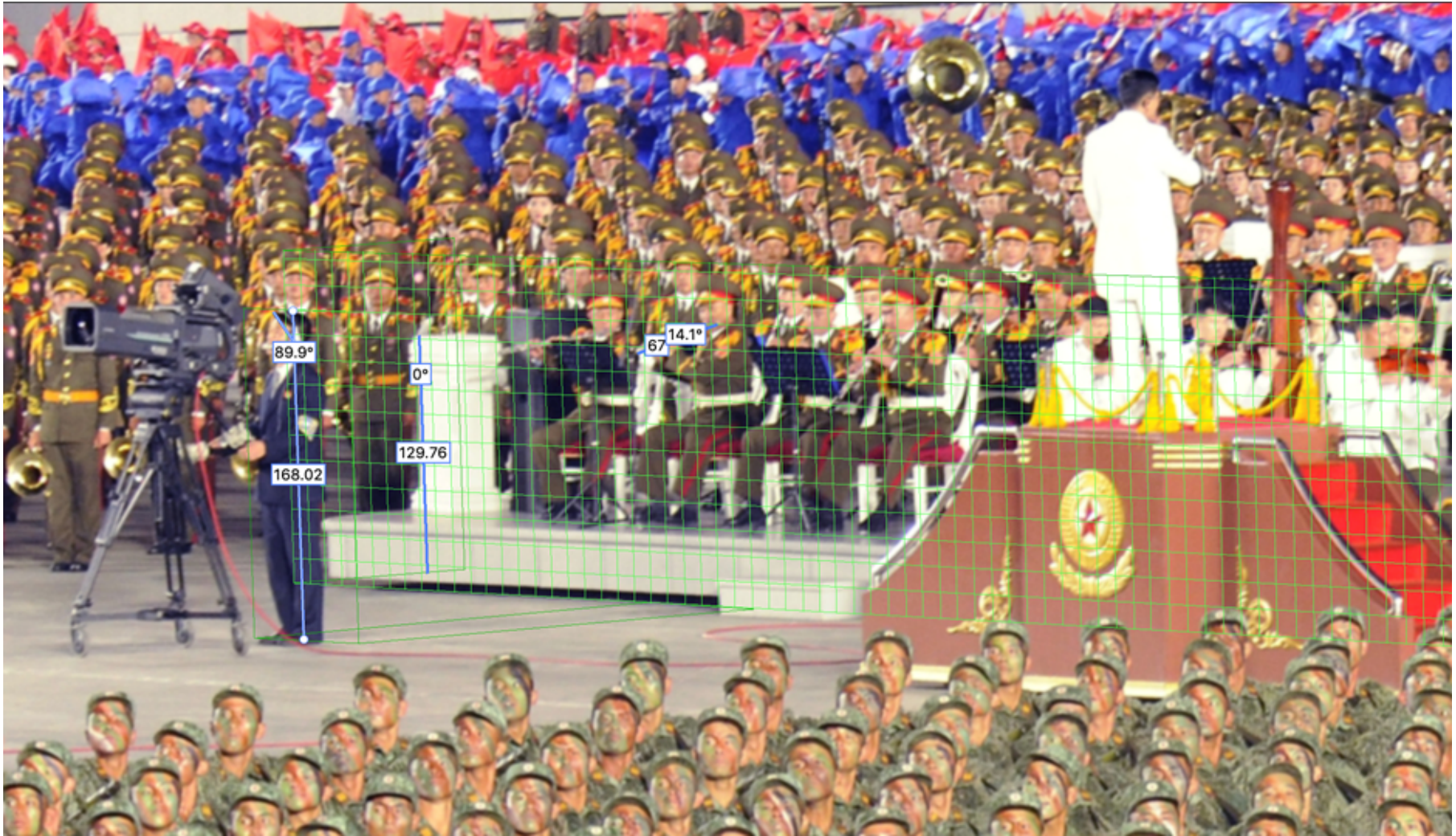
By using the flute as a known quantity, other dimensions in the image can be determined. Photo Source: Rodong Sinmun/KCNA via Ankit Panda [7]

Once we choose our image and determine our reference value, we can begin. Open the image in Photoshop and then select the Vanishing Point tool located in the filter menu. Add gridded planes using the Create Plane Tool. This simulates a 3d space within your 2d image and provides a way for your reference value to determine your desired measurement. For best results, planes should lay along flat surfaces that lead to vanishing points. From any plane, additional planes can be extended at known angles until ideally both the reference value and the desired measurement rest on a plane.