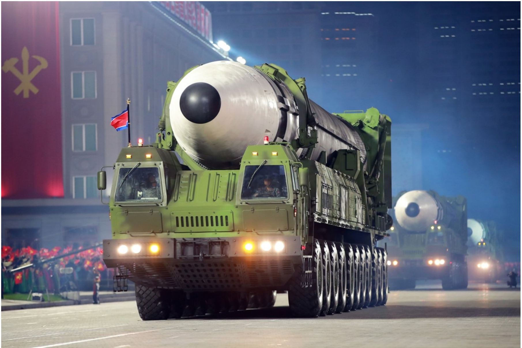
Head on view of the 11-axle transporter erector launcher in the 10 October 2020 Foundation Day Parade.

Collection of the best possible images of our subject is the first step. By best, it is not just meant high quality images, but also those that capture other known objects. This is important because this method uses relative sizes and known lengths as a way to determine our desired measurement. Luckily, the Foundation Day Parade was documented with a number of quality images. This isn't always the case though. Some images are distorted through the effects of wide angle lenses – something akin to “fisheye” images. We can attempt to correct for this using the visual effects (VFX) tools in open source software programs like Blender among others.