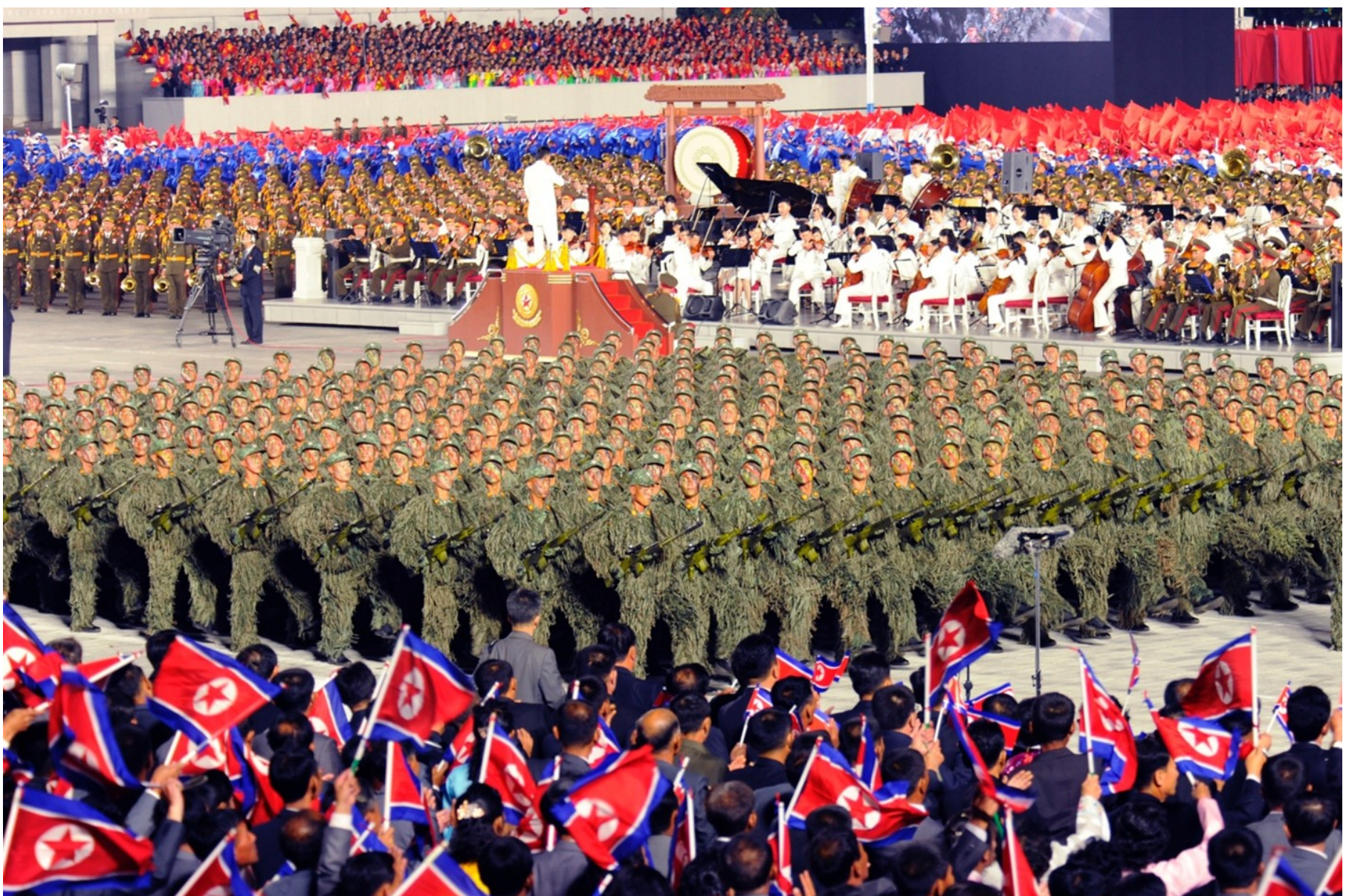
The parade orchestra playing to soldiers garbed in ghillie suits during the 10 October 2020 Foundation Day Parade. The little white pillar (circled in blue) is visible. Photo Source: Rodong Sinmun/KCNA via Ankit Panda [6]

The fantastic thing about orchestras is that modern instruments are often of uniform dimensions. Immediately to the right of our little white pillar sits the woodwind section and the flautists. The western concert flute is 67 cm in length and quite