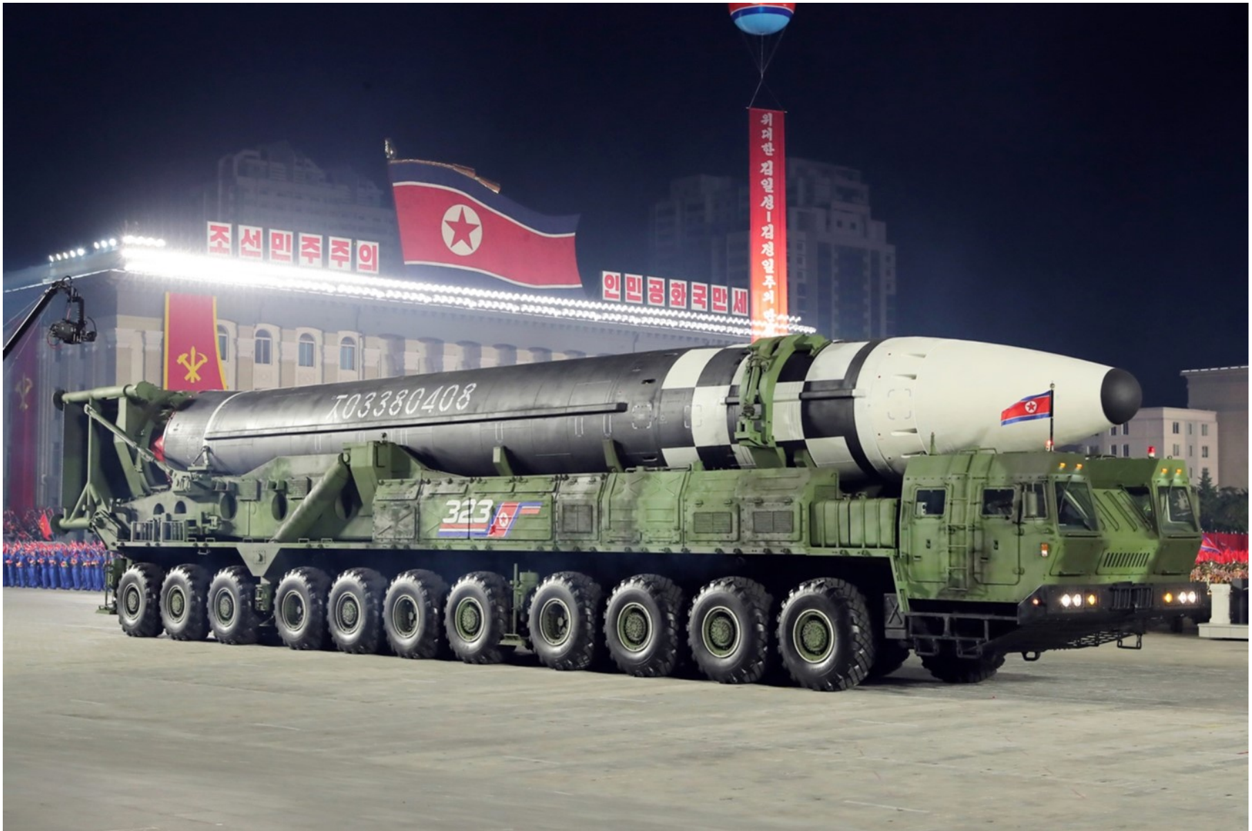
Searching the background of this image reveals a route to a known measurement. The small white pillar (circled in blue) stands adjacent to the parade orchestra. [5]