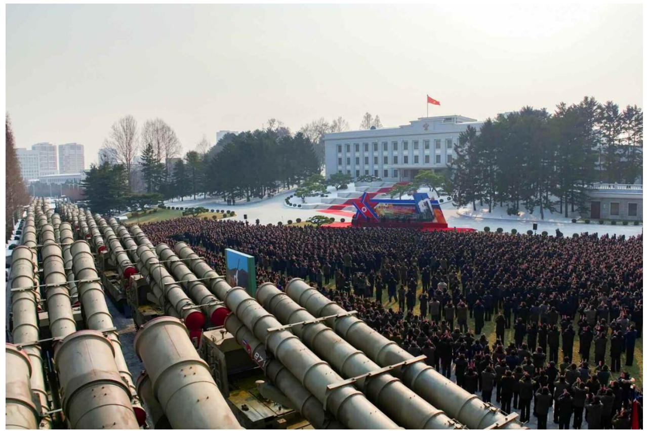
Figure 2. Approximately twenty 600 mm MLRSs are visible in this photo taken at the delivery ceremony on 31 December 2022.<sup>7</sup>

Besides the 6-tube 600 mm MLRS on tracked chassis, at least nine 4-tube 600 mm MLRSs on 4-axle truck chassis have been showcased in previous military parades.<sup>8</sup> The DPRK's access to heavy duty trucks remains sanctions-limited; however, during the 8 February 2023 military parade, the DPRK showcased at least 16 missiles on 9- and 11-axle tracked chassis, indicating that the DPRK may have significantly improved its access to heavy duty trucks.