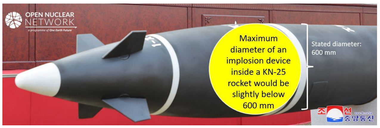
Figure 3. An implosion device inside a KN-25 rocket would be limited to below 600 mm in diameter. Image: KCNA<sup>10</sup>

and the strike distance, rather than the yield and size of the warheads.<sup>11</sup> While this classification is not necessarily consistent with the current, official DPRK nuclear weapon classification, it does present one possibility that a DPRK "tactical" nuclear device does not have to be necessarily smaller in diameter and size than a "strategic" one. Thus, the DPRK's nuclear claim regarding the 600 mm MLRS could be seen as a general reference for estimating the size of a DPRK implosion device currently in its arsenal (Figure 3).