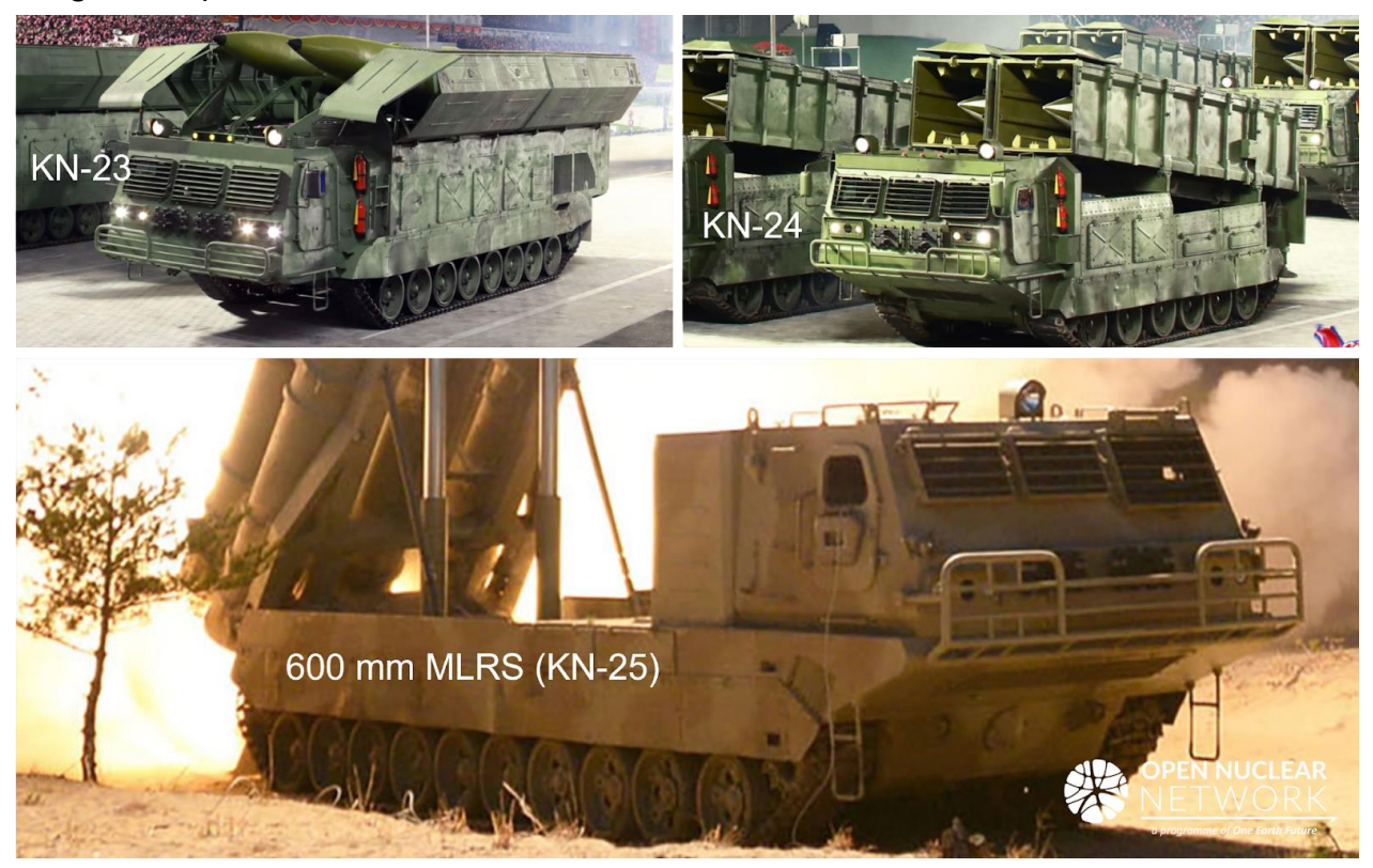
Figure 1. The tracked chassis of the 600 mm MLRS, with 10 road wheels on each side, is the largest of the new generation of short-range ballistic missile systems developed by the DPRK. In comparison, the tracked chassis of the KN-23 has eight road wheels on each side, while the tracked chassis of the KN-24 has six road wheels on each side.<sup>3</sup>

On 29 March 2020, in a 600 mm MLRS test fire to "verify once again the tactical and technological specifications of the launch system to be delivered to units of the Korean People's Army",<sup>4</sup> Ri Pyong Chol, the then-vice-chairman of the Central Committee of the WPK, reportedly "learned about relevant problems arising in delivering the weapon system to the units of the People's Army and set forth relevant tasks for the field of national defense science researches and munitions factories."5 Given that the tracked chassis of the 600 mm MLRS is the largest that the DPRK has produced to date (Figure 1), it is likely that the chassis is the source of the production problems.