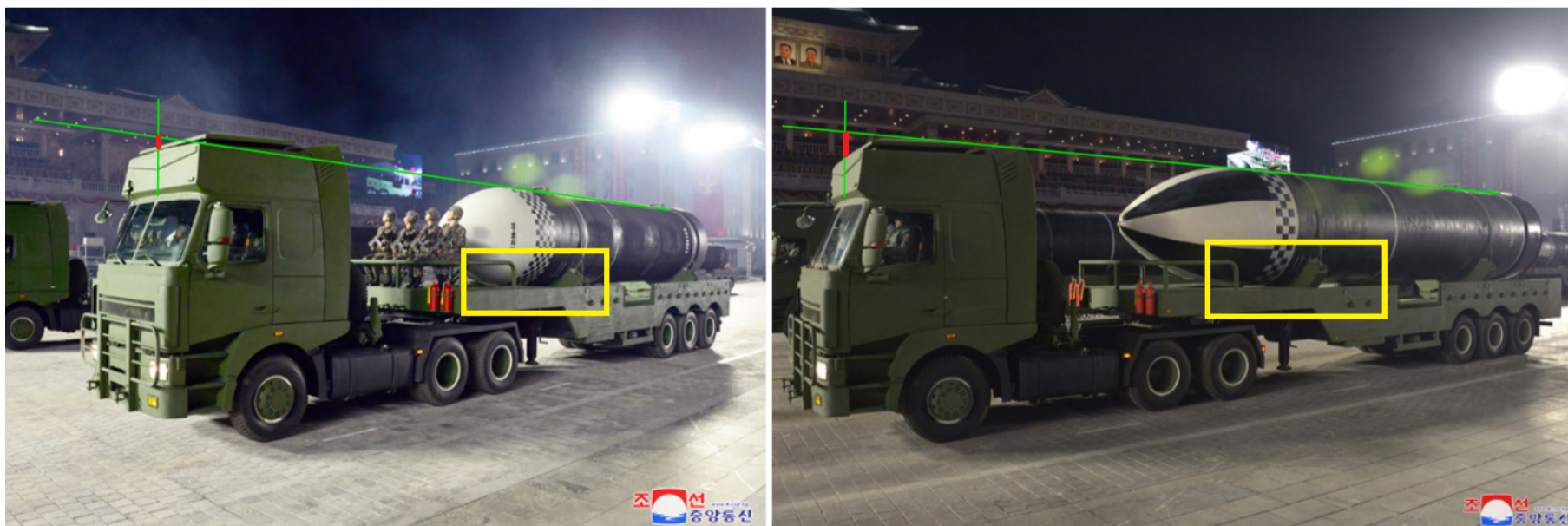
Pukguksong-4 during 10 October 2020 parade (left) and Pukguksong-5 during 14 January 2021 parade (right). The yellow boxes highlight the space between the missiles and the trailers, which, as indicated by the two green lines, suggest that the Pukguksong-5 is placed at a slightly more elevated position than the Pukguksong-4, possibly due to its lengthened body. The red lines show the height difference between the missiles and the tops of the truck cabins. In general, there appears to be no significant increase in diameter for the Pukguksong-5.

The most obvious difference between the Pukguksong-4 (only displayed during the 10 October 2020 parade) and the Pukguksong-5 is that the latter is visibly longer. Both missiles are carried by the same type of display trailer. However, while the trailer carrying the Pukguksong-4 had sufficient space for seats for soldiers (as seen in the image below), there is no such space on the trailer carrying the Pukguksong-5 due to the lengthened body and payload fairing of the missile.