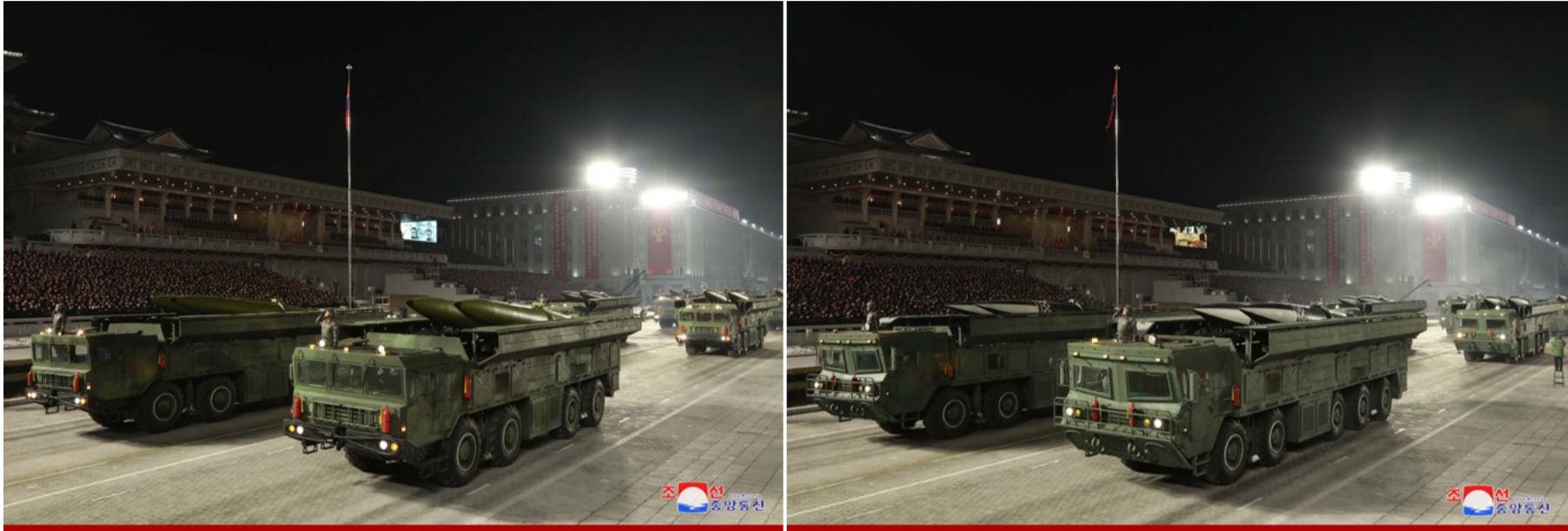
KN-23 (left) and the new solid fuel ballistic missile carried by a lengthened KN-23 truck (right). The truck cabin has also been modified.

This new solid fuel ballistic missile shares some similarities with the KN-23 [4] and KN-24. [5] However, the new missile is distinguishable by its five-axle truck. By contrast, the KN-23's truck has four axles (the shorter KN-24 is carried by a tracked chassis). This suggests that the new missile is longer and thus heavier than the KN-23.